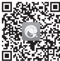
GREE+ App Download Linkage

Scan the QR code or search "GREE+" in the application market to download and install it. When "GREE+" App is installed, register the account and add the device to achieve long-distance control and LAN control of Gree smart home appliances.